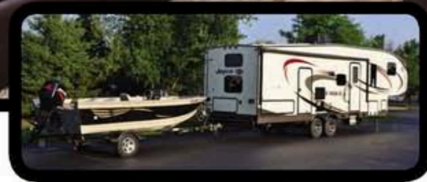
Residential amenities for the Jayco Eagle include "wood plank" vinyl flooring and Shaw residential carpeting, flexible seating options and a kitchen-island layout. Select models also offer a party sofa with stowable tables.

Rockwood fifth-wheel standard features include an electric hitch jack, A&E power awnings with LED lights, flat-screen TVs, microwave ovens, Bluetooth stereos with built-in DVD players, large ovens with flush-mount stove covers, under-mount sinks with high-rise pullout faucets and black tank flush, as well as winterizing ports.