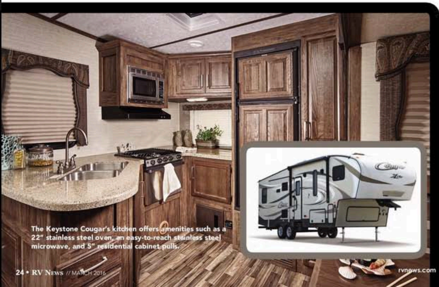
The Keystone Cougar's kitchen offers amenities such as a 22" stainless steel oven, an easy-to-reach stainless steel microwave, and 5" residential cabinet pulls.

Fifth Wheels $40K-and-Under Top Sellers in 2015 Compared to 2010 Statistical Surveys' data shows that the $40,000-and-under price category accounts for 28 percent of all fifth wheels sold. They had a market share growth of 5.96 percent for 2015.